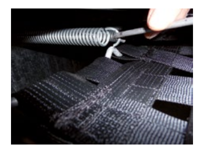
Hinging or unhinging the steel springs with the mounting tool

Important: the spring eyelets should point downwards !