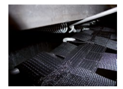
Hinging or unhinging the steel springs with the mounting tool

Important: the spring eyelets should point downwards !