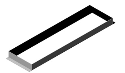
III. 2: aluminium frame